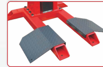
Adjustable, portable ramps with free installation.