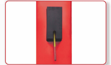
A manually locking release safety device controls the double locks.