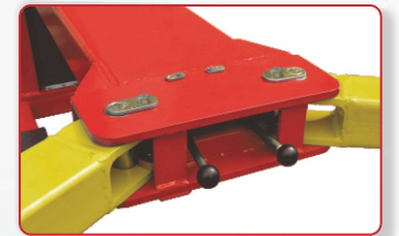
Arm locking device with easy to release handles.