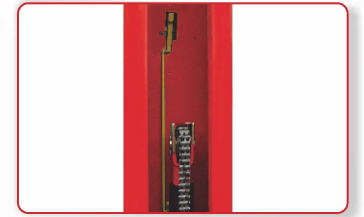
The chain protection cover prevents the chain from slipping off.