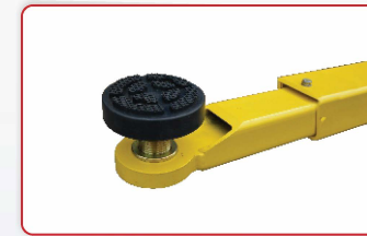
Features screw and insert rubber pads.