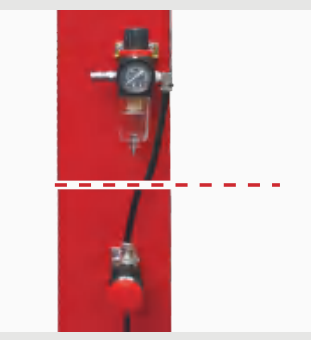
• Air controlled safety device.